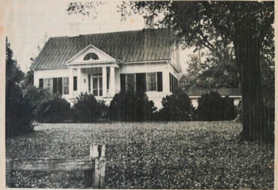
The Carrington Herbert Home.