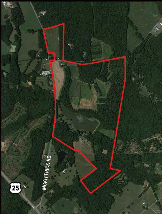
McKittrick Farm is located 25 minutes from downtown Greenville, SC.